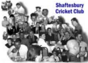
Shaftesbury Cricket Club